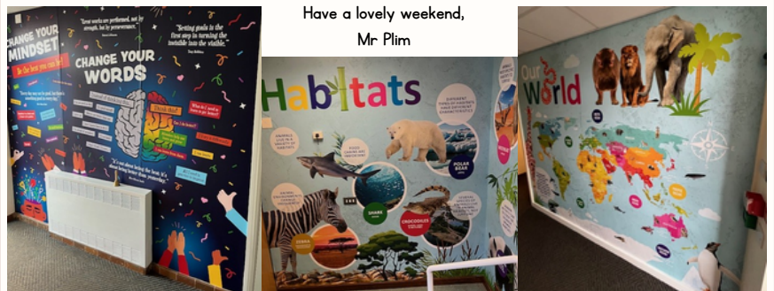
Have a lovely weekend, Mr Plim

If you haven't seen our wonderful new wall art, check out the pictures below - we hope you agree it looks AMAZING and really brightens up our corridors!